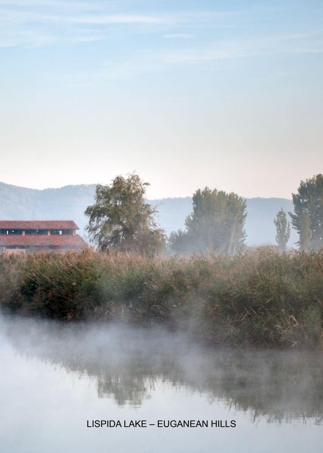
LISPIDA LAKE – EUGANEAN HILLS